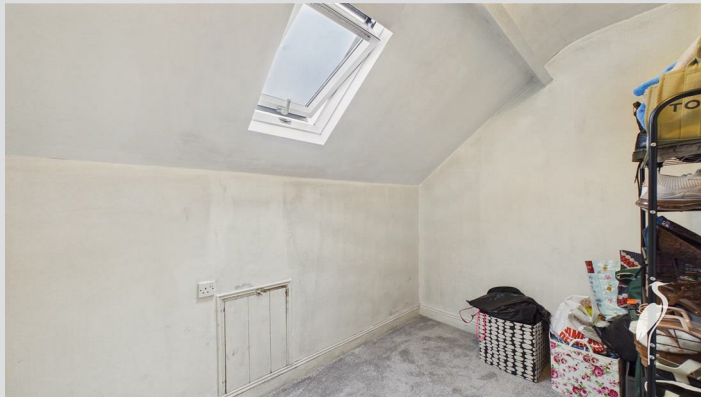
Double glazed skylight window.